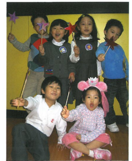
Young students at Star English are all happy learners.

JH: 我覺得自己是幸運的，因為兒童畫廊算是香港最早一批的learning centre。當時我的能力或許還未夠，但在日常的經營中我學到許多東西：